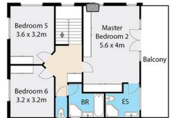
UPPER LEVEL (North wing)