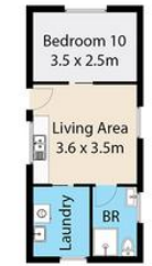
Granny Flat (Not exact location)