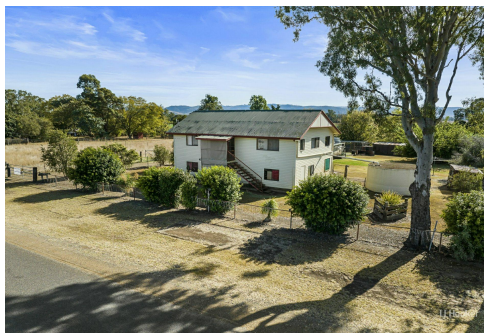
351 Cressbrook Caboonbah Road, CRESSBROOK