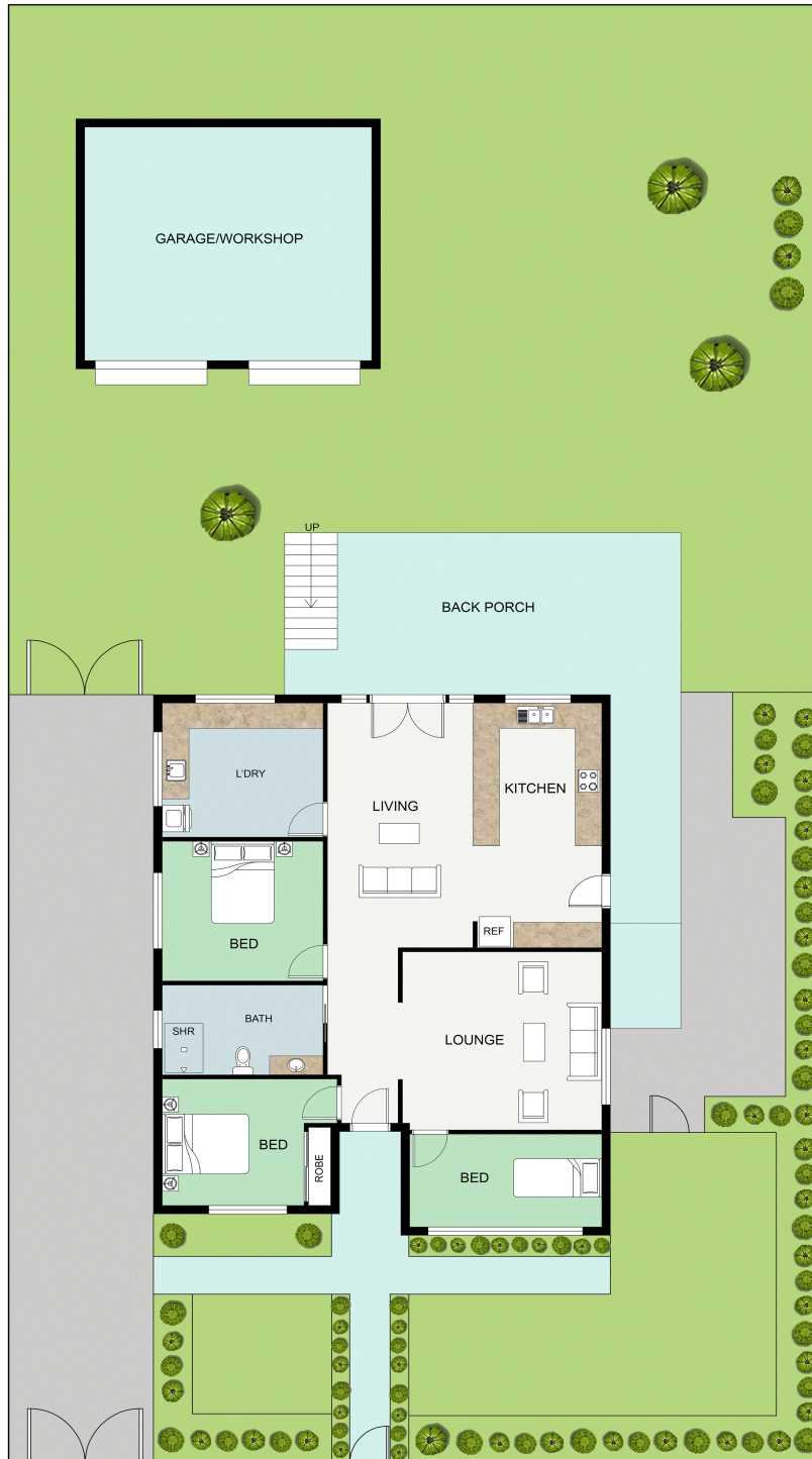
FLOOR ON SITE PLAN