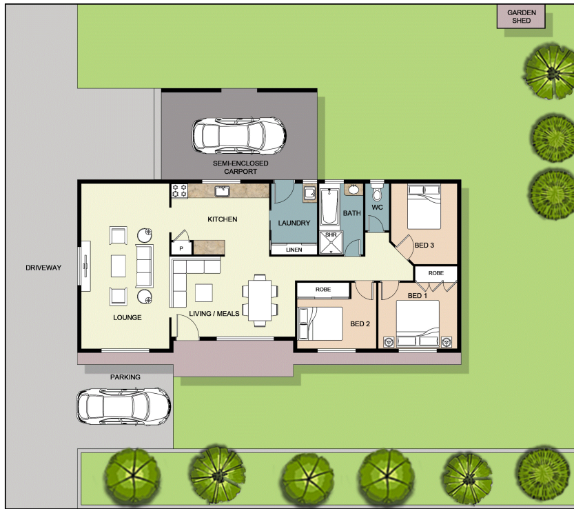
FLOOR PLAN ON SITE PLAN

This floor plan including furniture, fixture measurements and dimensions are approximate and for illustrative purposes only. BoxBrownie.com gives no guarantee, warranty or representation as to the accuracy and layout. All enquiries must be directed to the agent, vendor or party representing this floor plan.