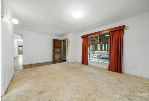
2 Rosalie Drive, YARRAMAN