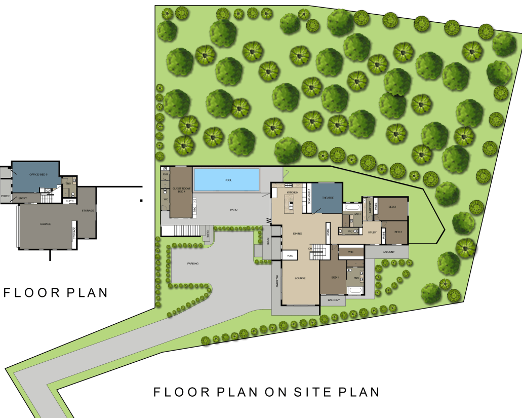
FLOOR PLAN ON SITE PLAN

This floor plan including furniture, fixture measurements and dimensions are approximate and for illustrative purposes only. BoxBrownie.com gives no guarantee, warranty or representation as to the accuracy and layout. All enquiries must be directed to the agent, vendor or party representing this floor plan.