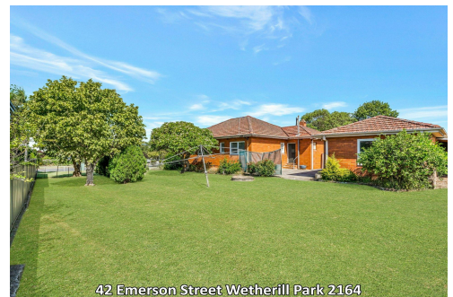
42 Emerson Street Wetherill Park 2164