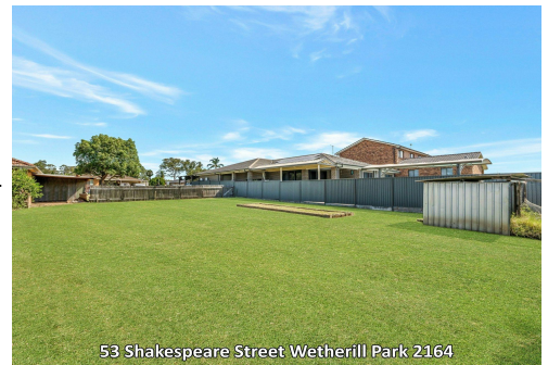
53 Shakespeare Street Wetherill Park 2164

edensorpark.ljhooker.com.au | edensorpark@ljhooker.com.au