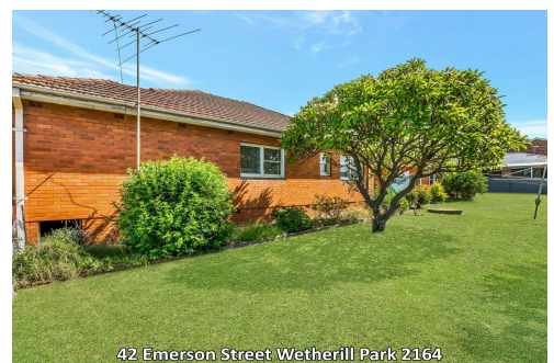
42 Emerson Street Wetherill Park 2164