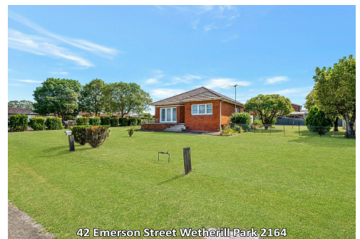
42 Emerson Street Wetherill Park 2164