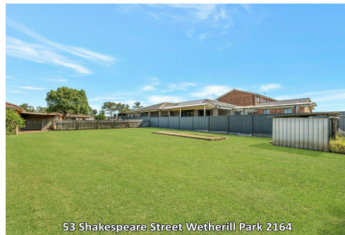
53 Shakespeare Street Wetherill Park 2164

LJ Hooker Edensor Park | Green Valley (02) 9823 8888 Shop 8, 207-215 Edensor Road, Edensor Park Plaza, EDENSOR PARK NSW 2176 edensorpark.ljhooker.com.au | edensorpark@ljhooker.com.au