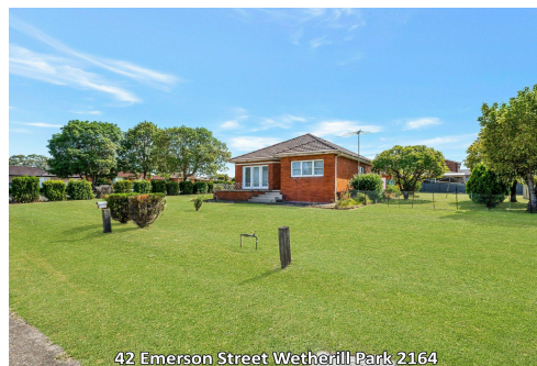
42 Emerson Street Wetherill Park 2164