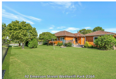
42 Emerson Street Wetherill Park 2164