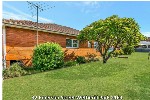
42 Emerson Street Wetherill Park 2164