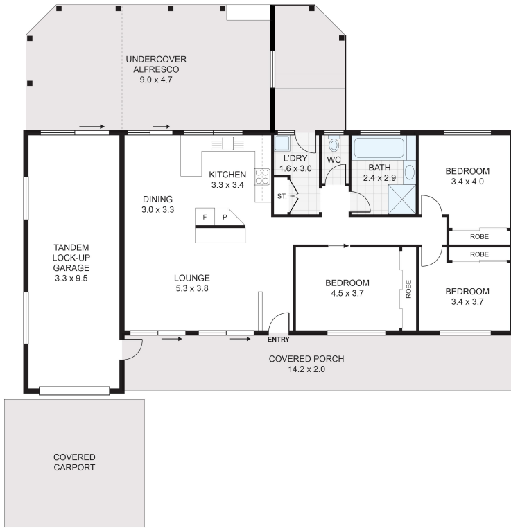
RESIDENCE : 142m 2