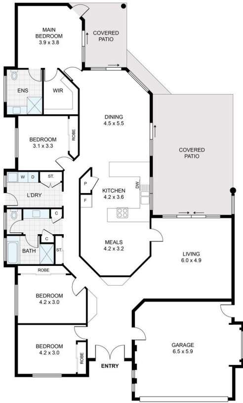
RESIDENCE : 227m 2