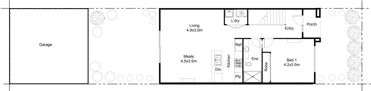
GROUND FLOOR ON SITE PLAN

This floor plan including furniture, fixture measurements and dimensions are approximate and for illustrative purposes only. BoxBrownie.com gives no guarantee, warranty or representation as to the accuracy and layout. All enquiries must be directed to the agent, vendor or party representing this floor plan.