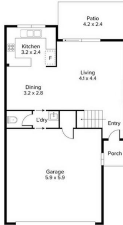
Floor Plan Ground Floor

Internal: 142m 2 External: 12m 2 Total: 154m 2