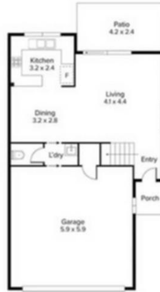
Floor Plan Ground Floor

Internal: 142m 2 External: 12m 2 Total: 154m 2