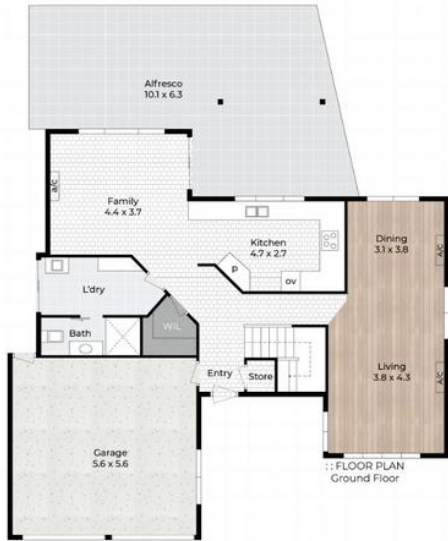
:: FLOOR PLAN Ground Floor