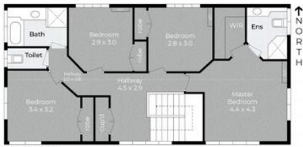
:: FLOOR PLAN First Floor