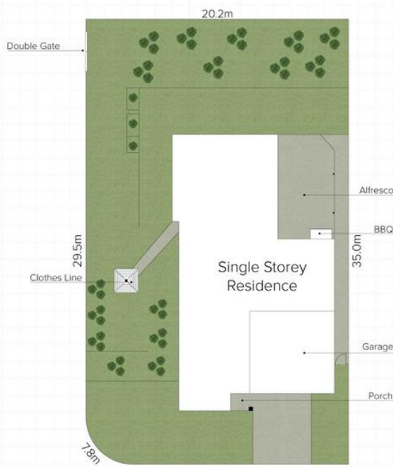
SITE PLAN CHERRY STREET