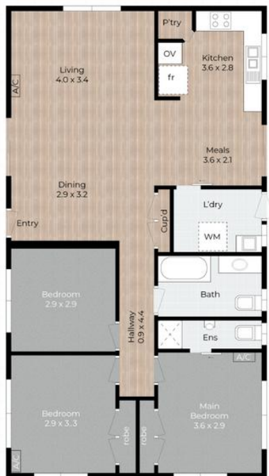
:: FLOOR PLAN