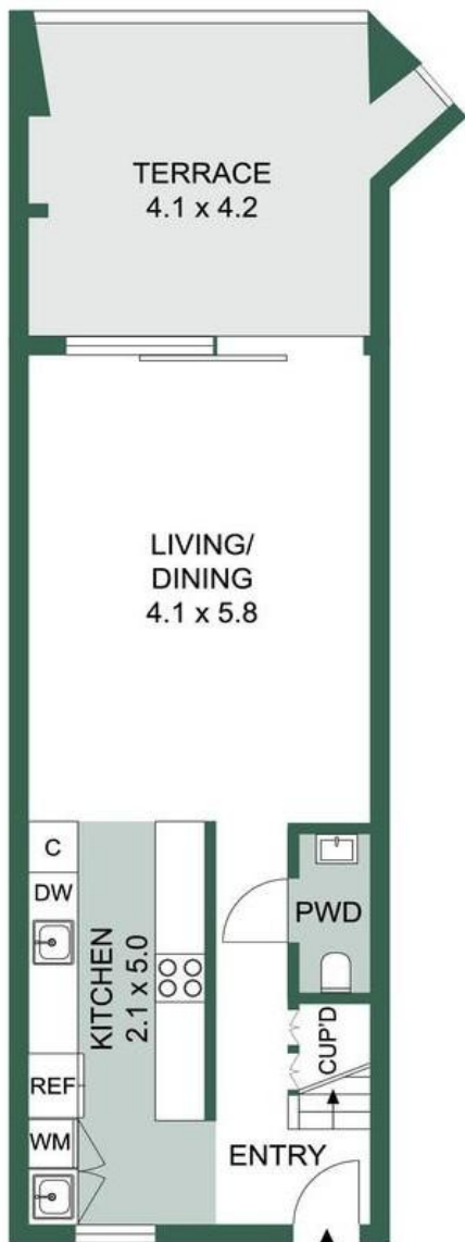
ENTRY LEVEL LEVEL TWO