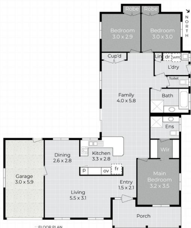
:: FLOOR PLAN