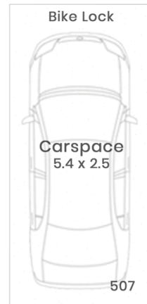
:: BASEMENT 2

MAHOGANY 507/56 Tryon Street UPPER MOUNT GRAVATT