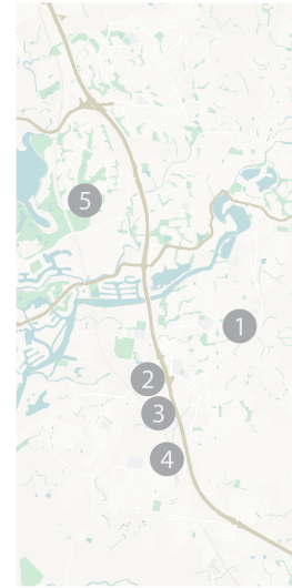
Location Map ::