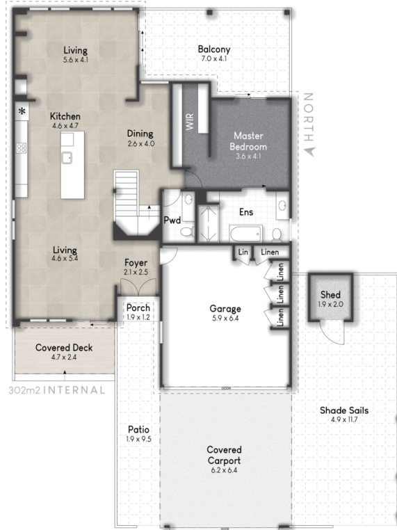
:: Upper Level ::