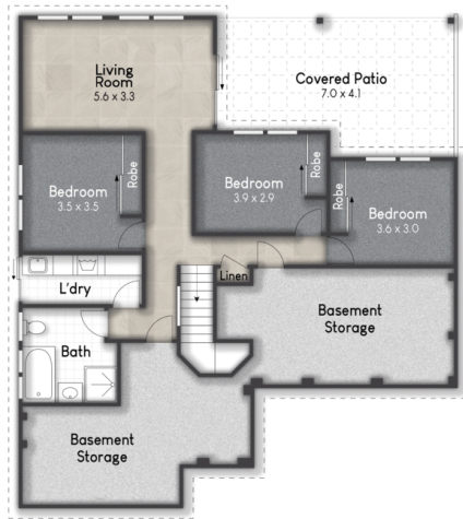
:: Lower Level ::