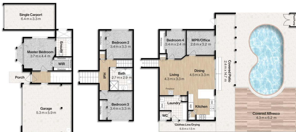
Ground Level Plan

This floor plan is a detailed representation created to enhance your understanding of the property's potential. While we strive for accuracy, dimensions are approximate and should be verified for complete assurance. LJ Hooker