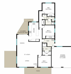
2/59 BUSHLAND DRIVE, TAREE