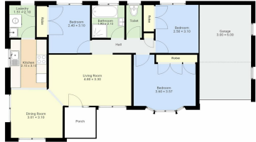
8 Forest Grove, Taree NSW This floor plan including fixture measurements and dimensions are approximate and for illustrative purposes only.