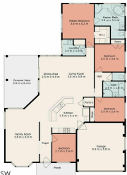
7 Melaleuca Drive, Taree NSW This floor plan including future measurements and dimensions are approximate and for illustrative purposes only.