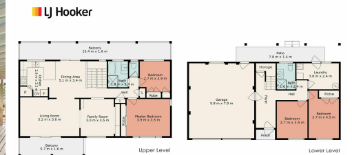
26 Wentworth Street, Taree NSW This floor plan including fixture measurements and dimensions are approximate and for illustrative purposes only.