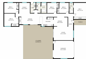
19 PETKEN DRIVE, TAREE WEST Floor Plan measurements are approximate and not for illustrative purposes only. Floor Plan by James Cullen Photography jamescullen.com