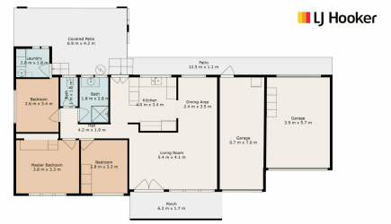
The floorplan including floor measurements and dimensions are approximate and for illustrative purposes only. 13 WHITBY CLOSE, TAREE NSW

LJ Hooker Taree (02) 6552 1133 227 Victoria Street, TAREE NSW 2430 taree.ljhooker.com.au | taree@ljhtaree.com.au