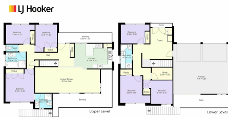
12 Cottonwood Street, Taree NSW This floor plan including fixture measurements and dimensions are approximate and for illustrative purposes only.