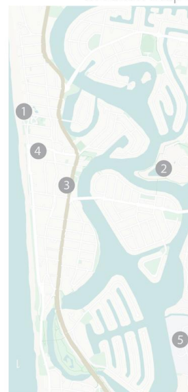
Location Map ::

3422 Surfers Paradise Boulevard, Surfers Paradise