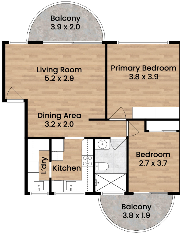
15/9 Holborow Close Surfers Paradise