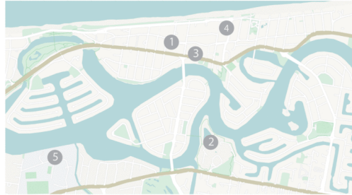
Location Map ::