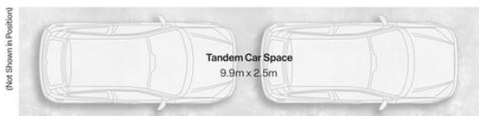
Tandem Car Space