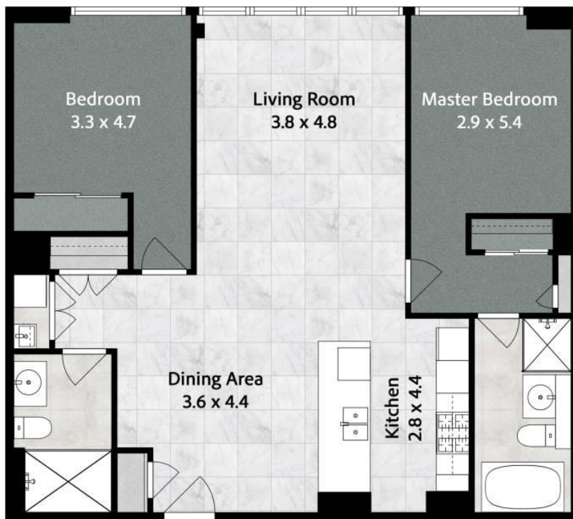
Apartment 5907 'Ocean' 88 The Esplanade, Surfers Paradise