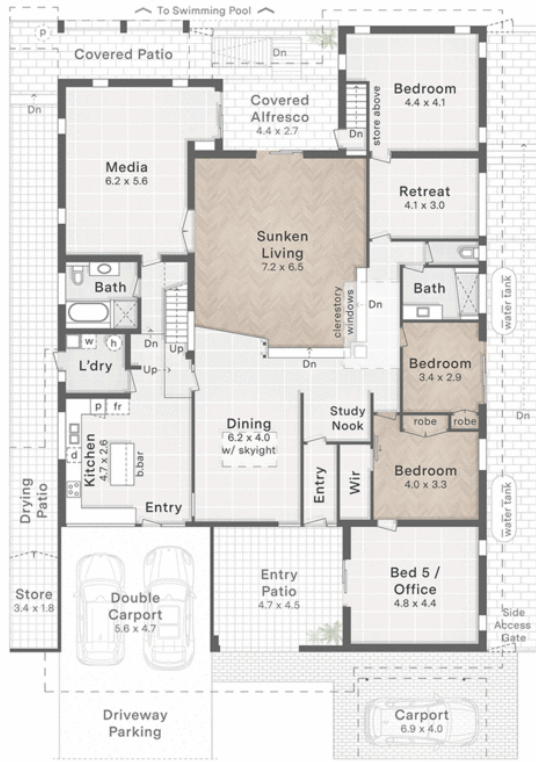
GROUND FLOOR Ceiling up to 3.2m