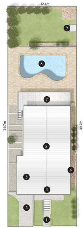
Site Plan Ridgeway Avenue