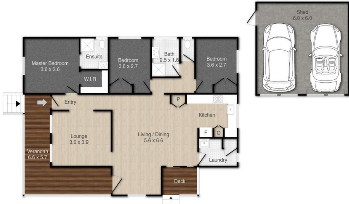
11 Waratah Drive, Russell Island House Area: 137m 2

PLEASE NOTE THIS PLAN IS FOR MARKETING PURPOSES AND IS TO BE USED AS A GUIDE ONLY. ALL MARKINGS, MEASUREMENTS, AREAS, AND LAYOUT ARE INDICATIVE ONLY AND INTERESTED PARTIES SHOULD MAKE THEIR OWN ENQUIRIES BEFORE MAKING ANY DECISIONS. FLOOR COVERINGS INDICATED ARE FOR ILLUSTRATIVE PURPOSES ONLY AND MAY NOT ACCURATELY PORTRAY ACTUAL FLOOR COVERINGS OF THE PROPERTY. NO GUARANTEES ARE MADE REGARDING THE INFORMATION CONTAINED IN THIS PLAN AND NO LIABILITY FOR ANY INACCURACIES IS ACCEPTED.