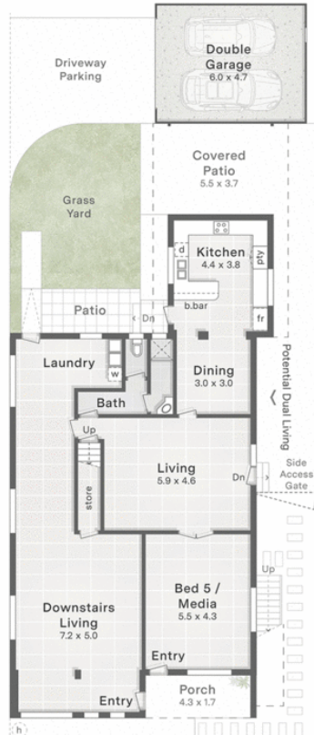
GROUND FLOOR 2.5m Ceiling