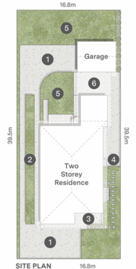
SITE PLAN Lingle Street