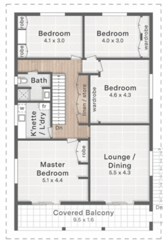
FIRST FLOOR 2.5m Ceiling

FloorScape DISCLAIMER: This is not a legal document therefore all measurements and information provided is subject to survey. No permission is given to use or alter this Floor Plan without the consent of FloorScape. The overall presentation style, layout, imagery, fonts, background, colours and terminology has been originally created by FloorScape and is subject to strict copyright. No ownership is taken of building design. Find out more at floorscape.au