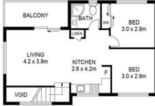
FIRST FLOOR (GRANNY FLAT)