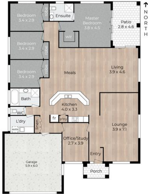
:: FLOOR PLAN