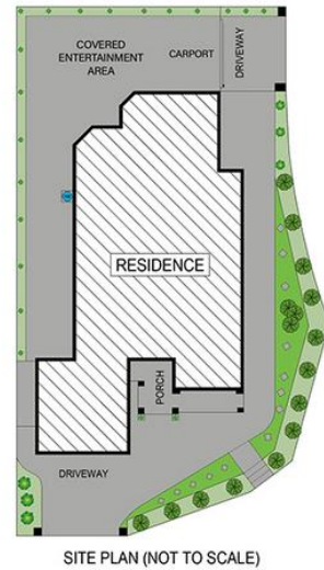
2 BLOSSOM PLACE, QUAKERS HILL