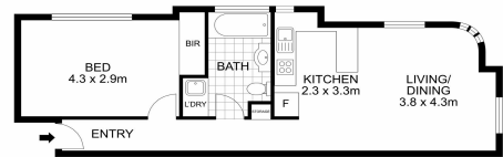
1102/243 Pyrmont Street, Pyrmont