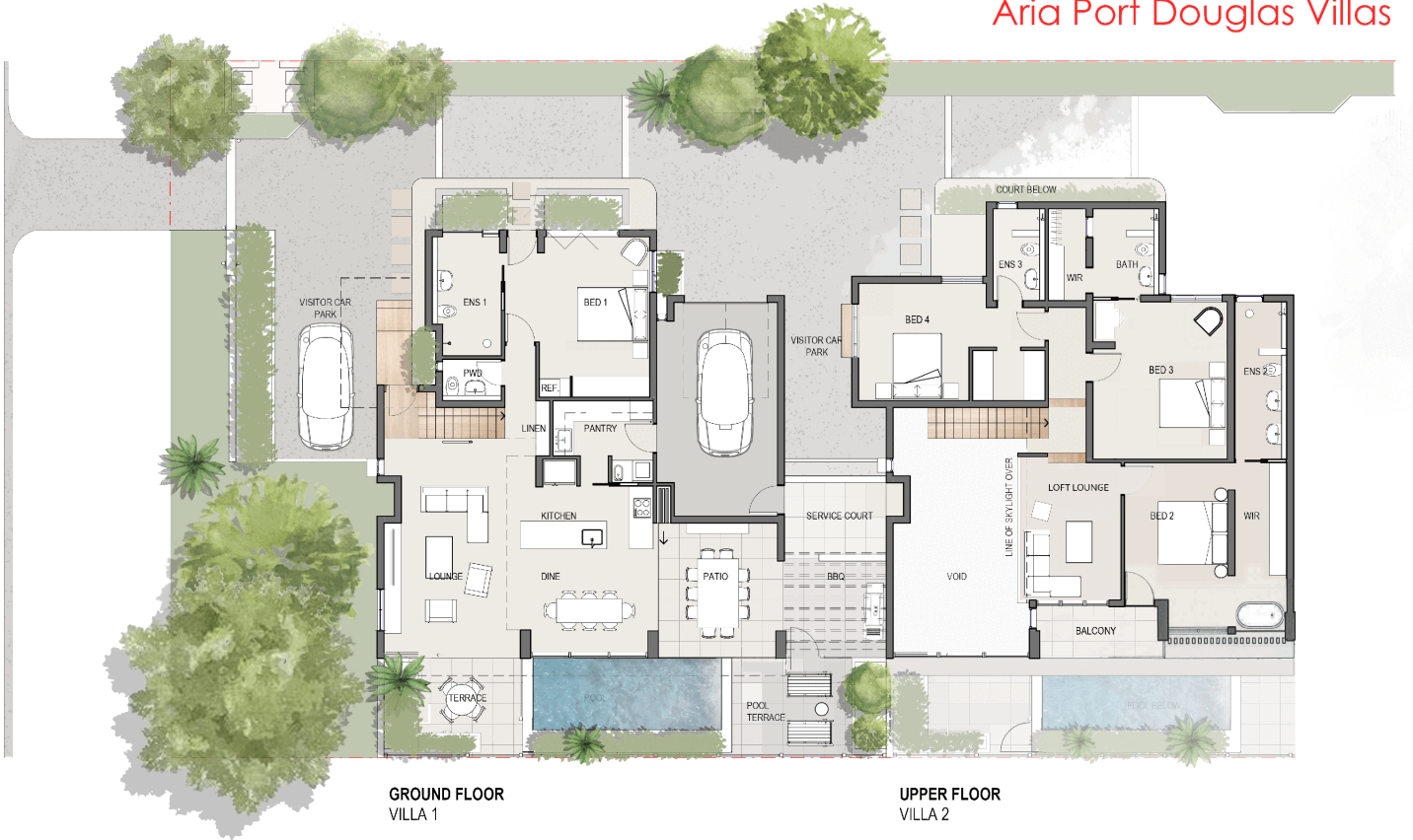
GROUND FLOOR VILLA 1