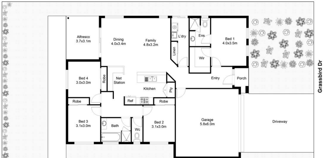
FLOOR PLAN ON SITE PLAN

This floor plan including furniture, fixture measurements and dimensions are approximate and for illustrative purposes only. BoxBrownie.com gives no guarantee, warranty or representation as to the accuracy and layout. All enquiries must be directed to the agent, vendor or party representing this floor plan.