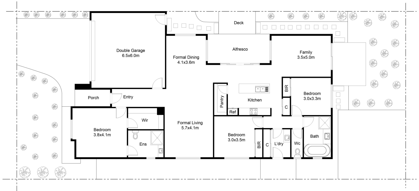
This floor plan including furniture, fixture measurements and dimensions are approximate and for illustrative purposes only. BoxBrownie.com gives no guarantee, warranty or representation as to the accuracy and layout. All enquiries must be directed to the agent, vendor or party representing this floor plan.