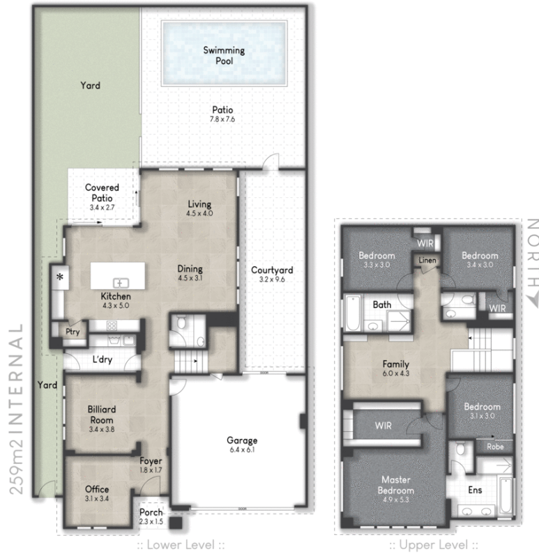
:: Lower Level ::