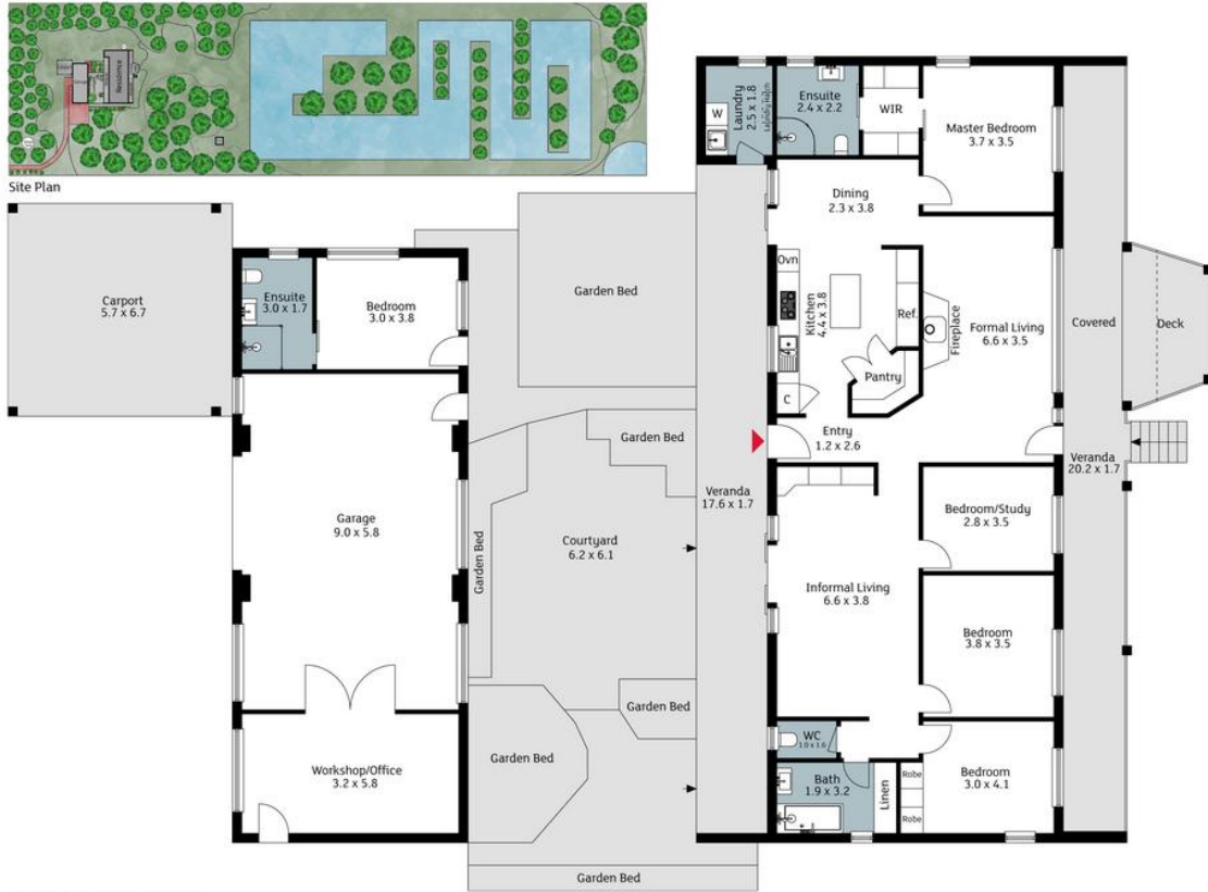
"Quinkin Ponds" 282 Ball Rd, Pearamon

The floorplan is not to scale; measurements are indicative and in metres. Exterior elements are not in position. Plans should not be relied on. Interested parties should make and rely on their own enquires.