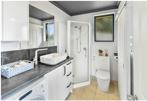
17A Keri Vista Drive

PLEASE NOTE: Specified floor and land area sizes have been obtained from sources such as Property GURU, Auckland Council (LIM) or Title documents. They have not been measured by the Salesperson or LJ Hooker - TNB Property Services Limited . We recommend you seek your own independent legal advice.