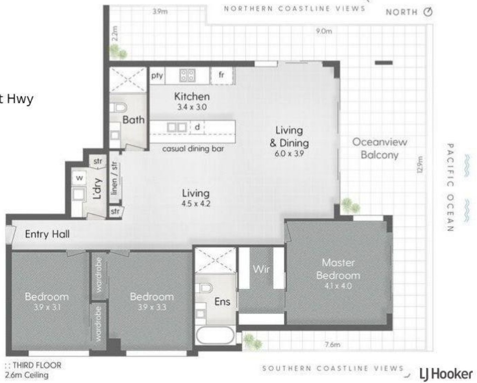
THIRD FLOOR 2.6m Ceiling