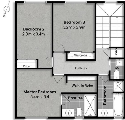
Upper Level Floor Plan