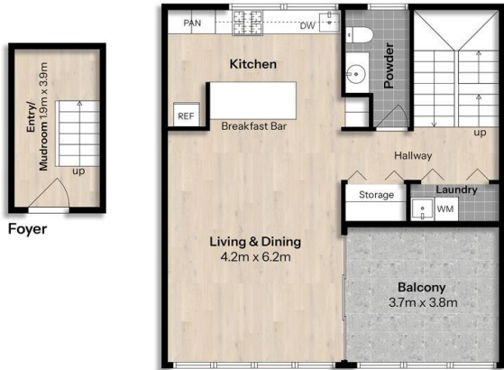
Lower Level Floor Plan